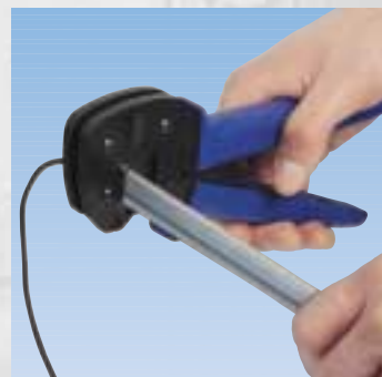
Pressing the endcap