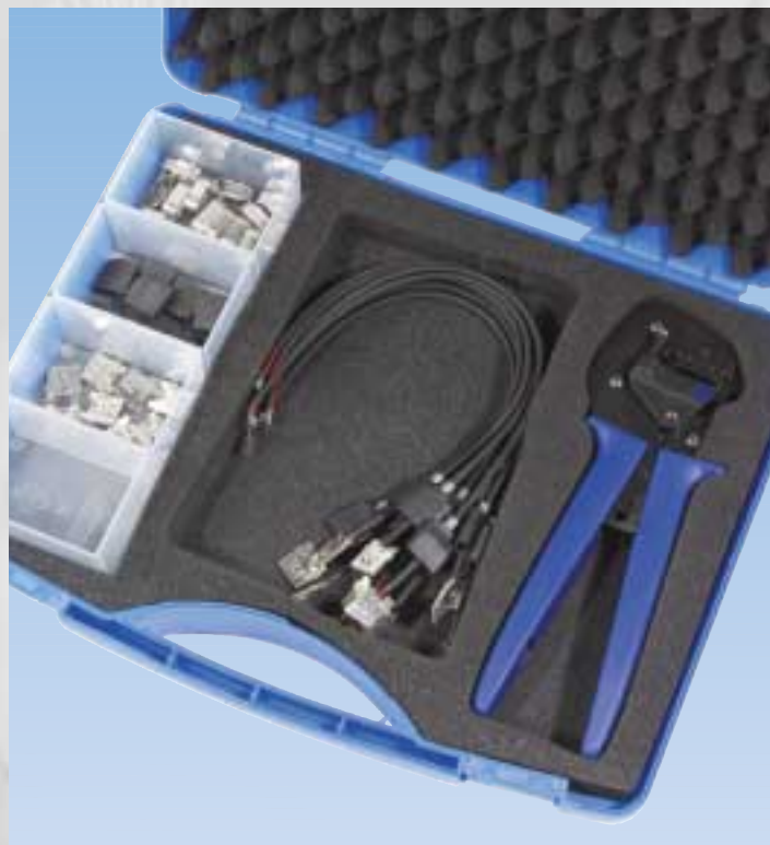
Standard service case