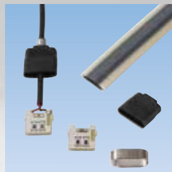
The Safety Element prior to assembly

ple is extremely simple. A piece of contact tube is cut to the required length. Using the crimping tongs the individual components – contact tube, spring contact plates, endcaps and sealing rings – are assembled to make up a functionally safe, water-proof and dustproof Safety Element.